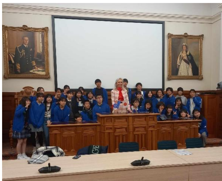
Shinagawa Students with Deputy Mayor Desley Simpson, on their day trip of Auckland City.